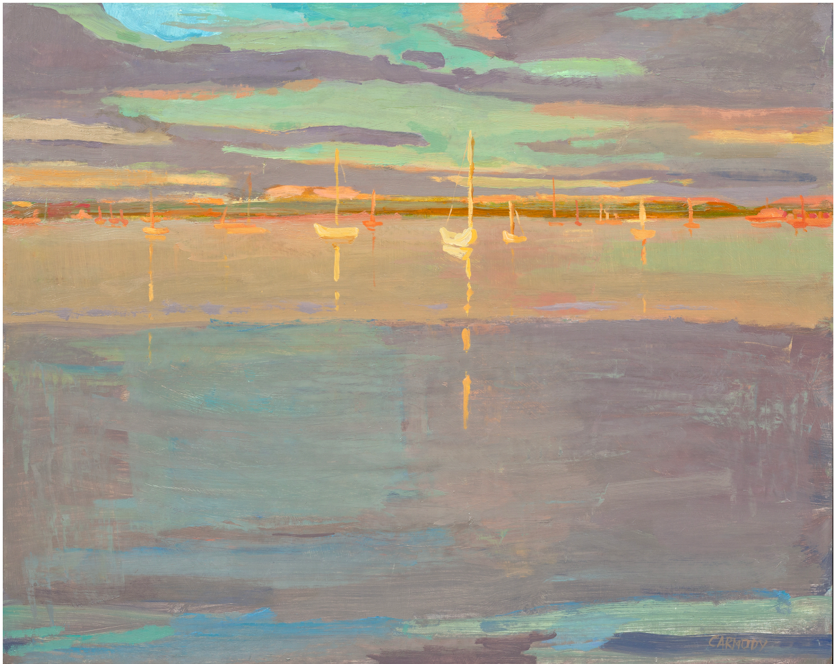
ARTIST KELLY CARMODY'S MOST RECENT SERIES DEPICTS BAYSCAPES OF SHELTER ISLAND.